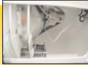
Lamp Suspension System