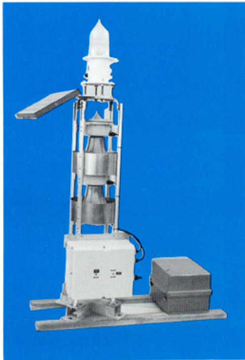
WITH DA-2 SOUND SIGNAL