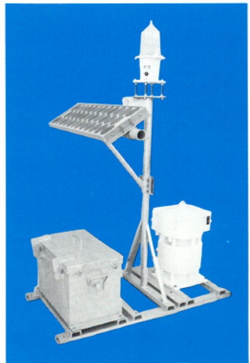
WITH SA850/1A SOUND SIGNAL

Automatic Power offers two Class B Single Lift Assemblies. Each is compact and rugged one with the DA-2 half mile sound signal and one with the SA 850/1A half mile sound signal. Each one meets or exceeds U.S. Coast Guard requirements for Class B Aids to Navigation as specified in 33CFR Sub-part 67. Each self contained unit includes a solar power system with batteries and battery box. The solar array can be positioned in the field to assure it faces due south.